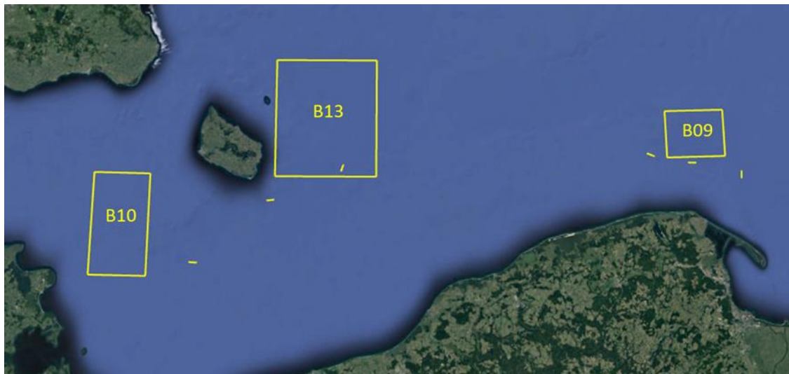
Abb. 1a: Cruise 469 FRV 'Walther Herwig III', 10.08. - 24.08.2023: Location of the fisheries stations (bottom trawling) no. 6 – 11 in the Baltic Sea. Due to special requirements (water depths), most of these stations were not located in the standard areas B09, B13 and B10.